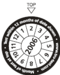
Example shows next test due: February 2007.

When a Milk Meter has been tested, a “Test date” label must be affixed to the Milk Meter. This verifies that the Milk Meter has been tested and indicates the date the test was done. The label is colour coded by year, with the months of the year around the perimeter. Affix a label to the Milk Meter body with the number of the month of test (e.g. March=3, November=11) at the top of the Milk Meter. The Milk Meter must be tested within 12 months of the date shown.