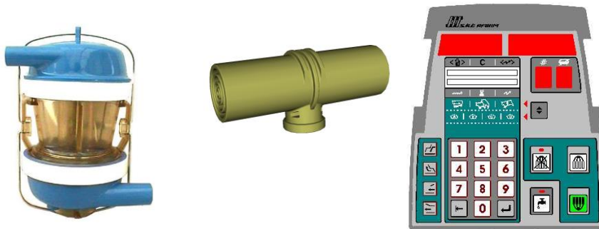
Figure 1. The Afiflo 2000 milk meter and the different components.