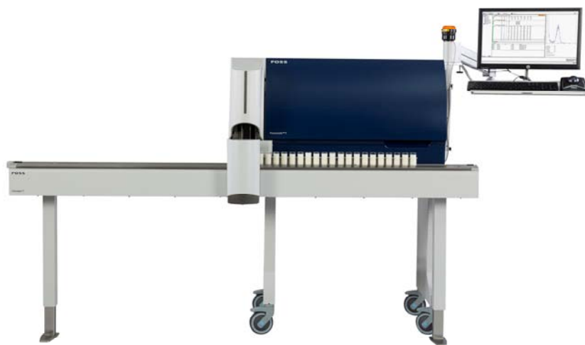
Figure 2. Fossomatic™ 7.