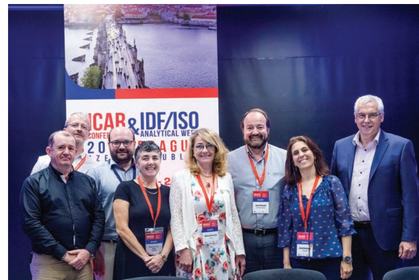
Speakers of the Milk Analysis Workshop in Prague.

For the activities of the next year, a short Survey among ICAR reference laboratories laboratories will be carried out to verify whether if specific problems have been identified using the milk analysers..