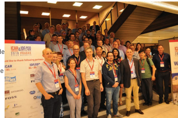
Picture of the participants to the Interbeef Workshop held in Prague

No less importance is the extension in the near future of Interbeef services to include facility to share ID, ancestry, performance and genotypes between members and the development of a systems to support Interbeef genomic evaluations as a routine service in future.