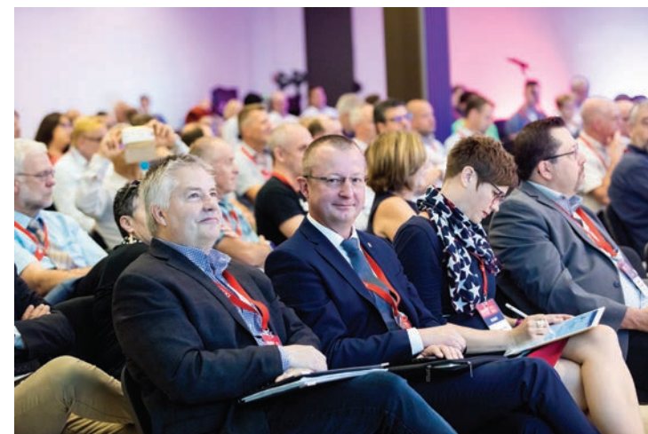
Some representatives of the ICAR Member Organisations attending the General Assembly.

In the next months, three Organisations are expecting to renew or review their previous certification.