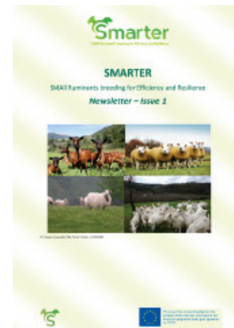
Cover of the first issue of the Smarter Project, in which ICAR is among the partners. The issue is available here

More information about Smarter can be found in the web site of the Project ( here ) and in the first issue of the Newsletter ( here )