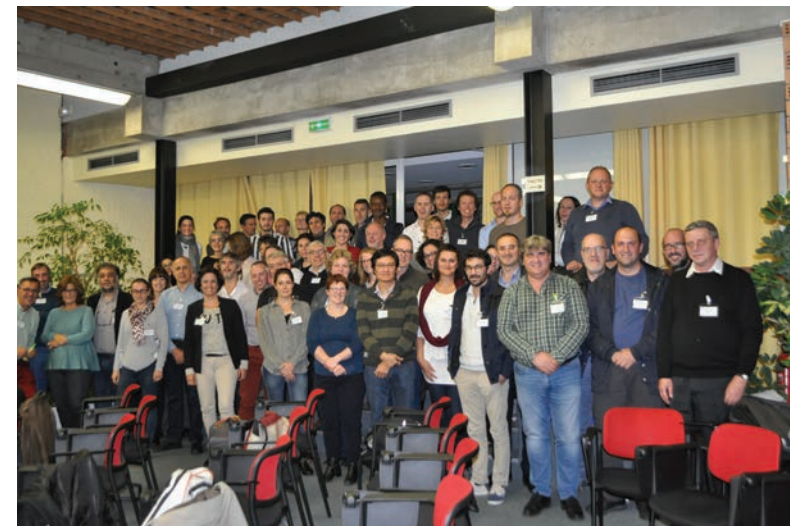
Participants of the Smarter Project at the kick-off meeting