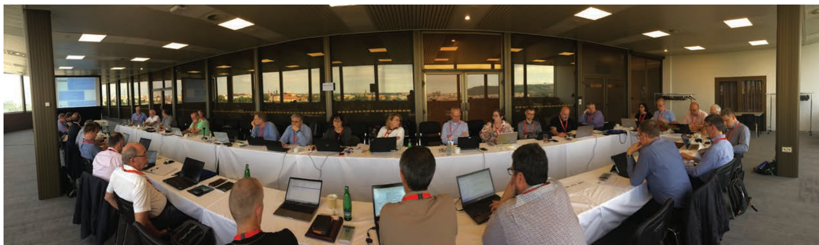
The meeting of the Board with the Chairs of the ICAR Groups where common strategies and cross-group actions have been debated

In Prague, the Board met all the Chairs of the ICAR Groups in order to debate the latest achievements and present the future activities proposed for the 2019-2020. A picture of that meeting is reported below.