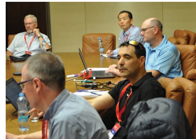
Members of the DCMR WG having their meeting in Prague.

The Working Group is working on the finalisation of a new text of the ICAR Guidelines (Section 2, Procedure 1) referring to the computing 24-hours yields. Moreover, the DCMR WG is comparing different 24-hours calculation methods and the end of this duty is expected to be reached by 2020.