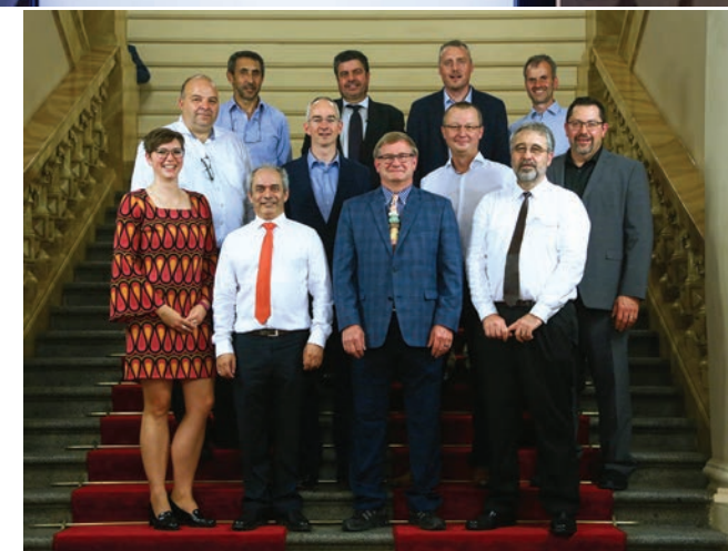
Members of the ICAR Board at the Prague 43rd Annual Conference.