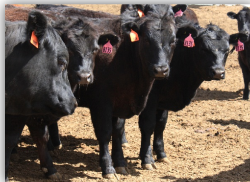
Table 1 shows the potential cost savings to the US beef cattle industry that could occur with selection for feed intake, feed efficiency, growth, and carcass traits. Calves and yearlings selected for residual feed intake (RFI) have the same ADG but eat less feed thus saving feedlot operators money. Assuming 27 million cattle are fed per year and that 34% of cattle in the feedlot are calves and 66% are yearlings, the beef industry could save over a billion dollars annually by reducing daily feed intake by just 2 lb. per animal.

The traits that beef producers routinely record are outputs which determine the value of product sold and not the inputs defining the cost of beef production. The inability to routinely measure feed intake and feed efficiency on large numbers of cattle has precluded the efficient application of selection despite moderate heritabilities ( h^2 = 0.08-0.46 ). Feed accounts for approximately 65% of total beef production costs and 60% of the total cost of calf and yearling finishing systems. The cow-calf segment consumes about 70% of the calories; 30% are used by growing and finishing systems.