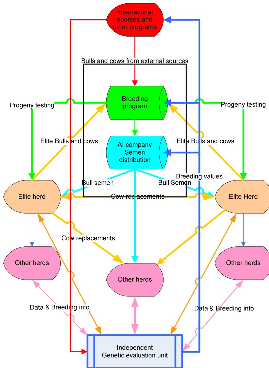
Figure 2. Schematic representation of the structure of a typical cattle breeding programme

These developments has made it possible for the involvement of the commercial producer in breeding and the genetic improvement process in the ruminant animal. Animal identification plays a similar role in poultry breeding. In this case the overwhelming need to maintain accurate pedigree which is central to the ability to make genetic improvement of traits is the biggest motivation. Because of the need to record fitness and reproductive information such as fertility and hatchability, identification of a chick starts on the day the egg is laid. Identification of the hen that laid the egg and her mate is essential in determining the genetic merit of each bird in the fertility of the egg. Whereas factors such as the quality of the shell and its content can be considered direct traits of the hen, egg fertility, embryo survival and hatchability are influence jointly by both the hen and her mate (Wolc et al, 2011). Genetic analysis of these traits thus require accurate identification of the hen that laid