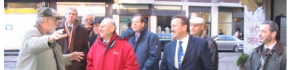
SC in Milan Nov. 2005