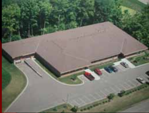
Offices and Manufacturing Facility