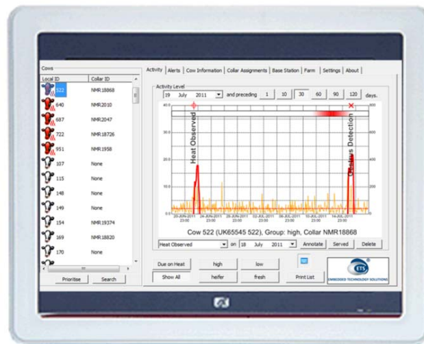
Figure 2: PC display.

The PC displays the activity behaviour and patterns indicative of meaningful events (Figure 2).