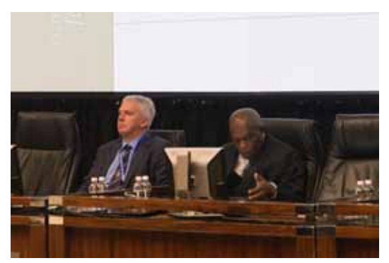
Martin Burke, CE ICAR and the Minister of Agriculture of South Africa the Hon. Mr. Senzeni Zokwana

Around 130 participants from 30 countries met in Pretoria, South Africa, on 14-16 April 2015, at the occasion of the international Symposium jointly organized by the Food and Agriculture Organization of the United Nations (FAO), the International Committee for Animal Recording (ICAR), the South African Department of Agriculture, Forestry and Fisheries, the Stud Book and Animal Improvement Association and the Agricultural Research Council of South Africa. the African Union Inter-African Bureau for Animal Resources, and their public and private