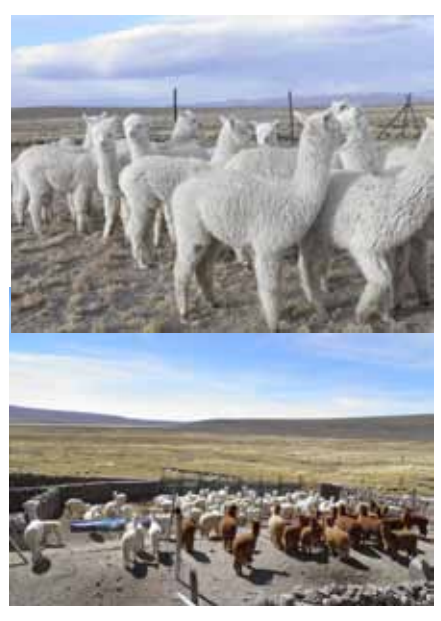
Pictures taken at the Alpaca Genetic Improvement Station (CEDAT) in Peru

DESCO, our Peruvian ICAR member, follows the Alpaca improving program (PROMEGE - Programa de Mejoramiento Genético en Alpacas) in the CEDAT (Centro de Desarrollo