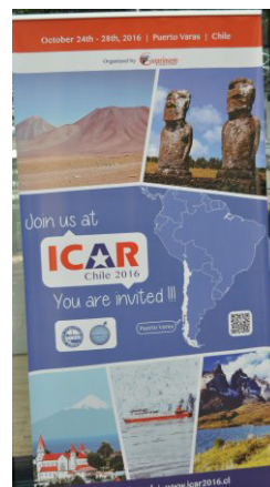
The banner announcing the ICAR 40th Biennial Session in Puerto Varas (Chile) in 2016