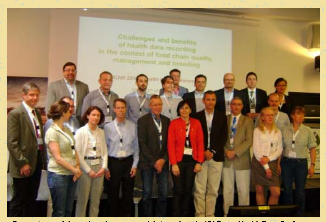
Group picture of the authors that presented their work at the ICAR 2013 Health Data Conference.