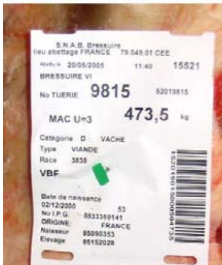
Figure 2. The label on the carcass.

Controls from veterinaries of the Ministry of Agriculture.