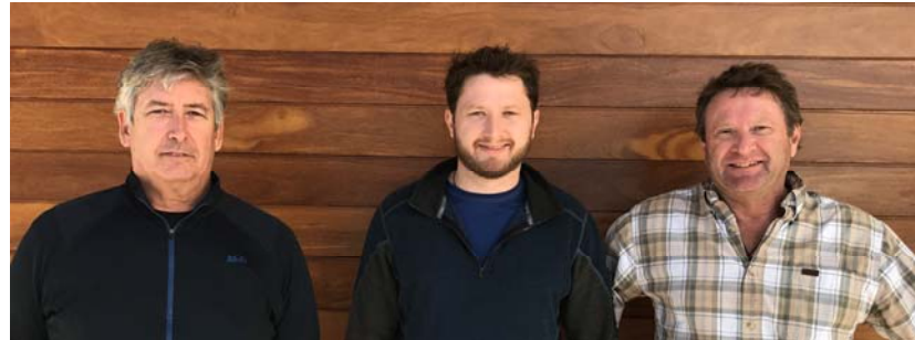
Expansion in 2017