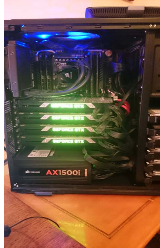
Cost-effective gaming computers with multiple Titan graphic cards (GPU)