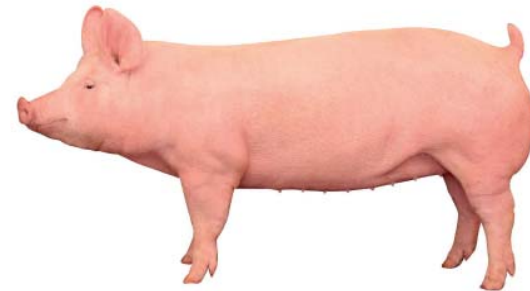
Dam Line (N=935)