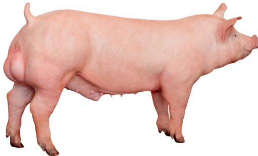
Sire Line (N=2,153)